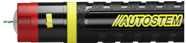
Above: Yellow Safety Tab

AutoStem Gen III is the world's only entirely safe rock breaking product. Without inserting the safety tab prior to use, initiation of the product cannot cause harm, ensuring maximum user safety at all times.